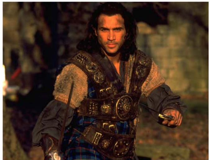
Adrian Paul plays the Highlander for the long-running TV series.

✠ 2000: "Highlander: Endgame" unites Lambert with Donnie Yen, Adrian Paul and the cast of the TV series. Paul is named "Sexiest Action Star" by People Magazine .