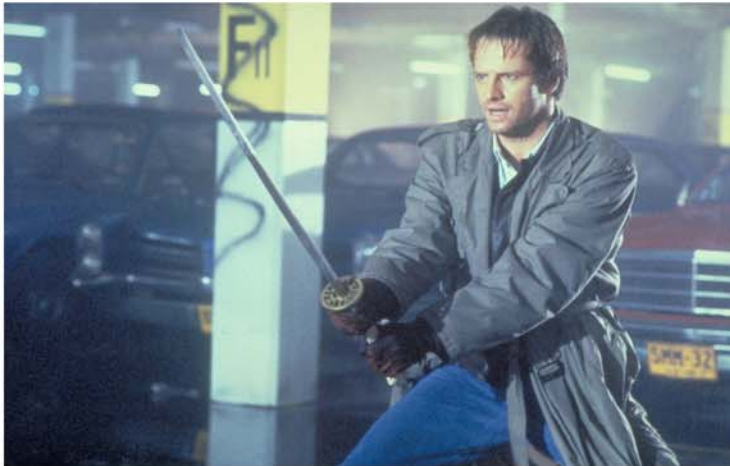
Christopher Lambert wields a katana in the first "Highlander."

✠ 1986: The myth is born. "Highlander" is released starring Christopher Lambert and Sean Connery. Queen writes the title song "Princes of the Universe" and names its album "A Kind of Magic" after a line of dialogue.